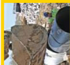
A piece of Snap-Tite® pipe is lowered into position into the host pipe.