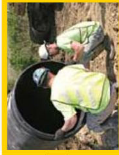
A gasket is installed on the next piece of pipe, assuring a watertight seal when connected, meeting ASTM D3212 requirements.